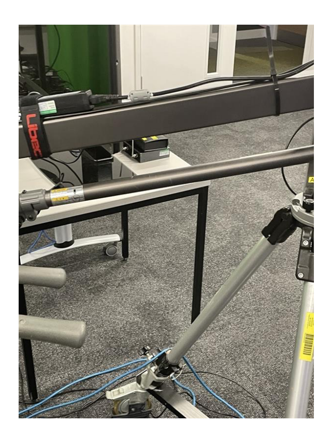
Hazard: crane can trap limbs if used improperly.