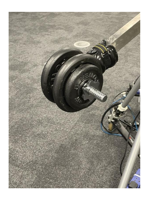
Can accidently bump into hit.