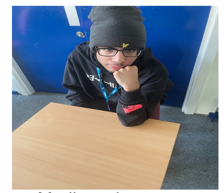
Medium close up.

We see a school student walking in a corridor looking very tired.