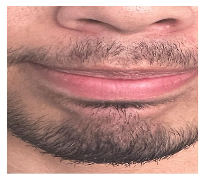
Extreme close up shot.

The camera zooms to the actors mouth whilst he is chewing on the Snickers bar.