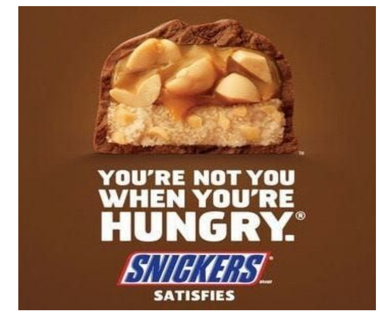
In the end of the advert there will be a pop up that will say you're not when you're hungry.

The student is working on the computer with lots of energy.