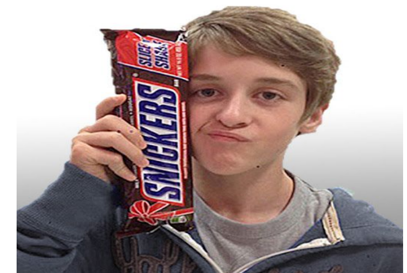
Extreme close up