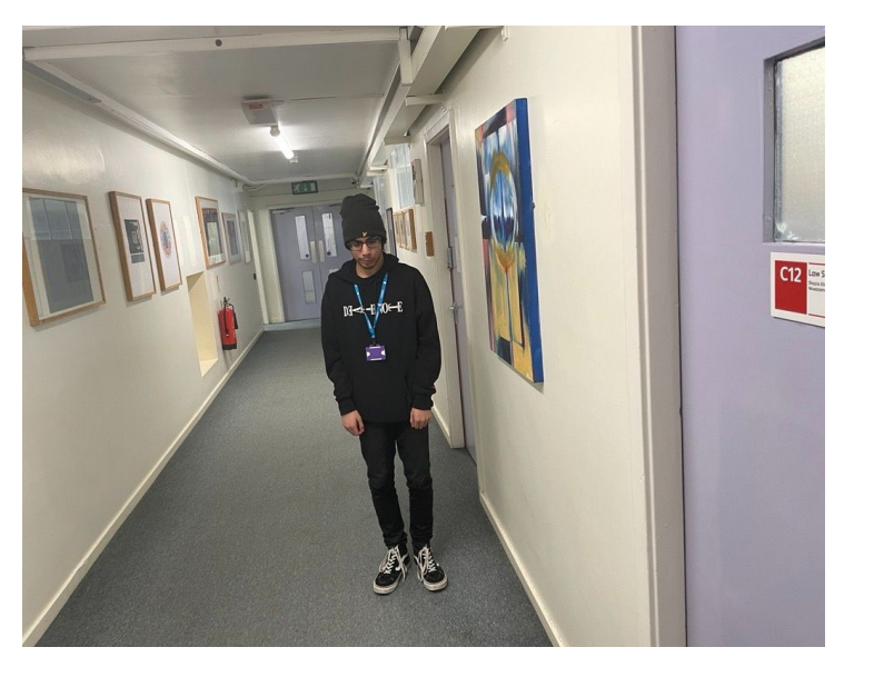
Medium close up, full shot or medium shot.

We see a school student walking in a corridor looking very tired.