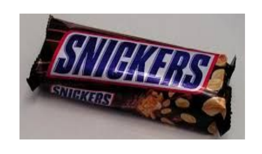
Extreme close up.

The student starts making his out of the classroom.