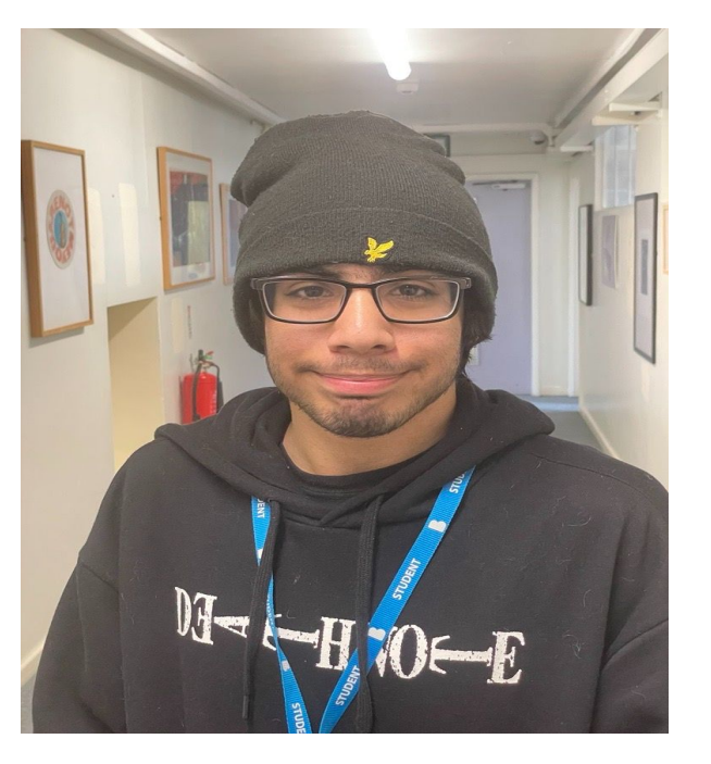
Medium close up, full shot or medium shot.

The student is walking in a corridor smiling with lots of energy.