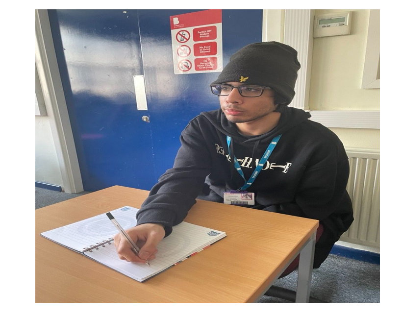
Medium close up

The student is walking in a corridor smiling with lots of energy.