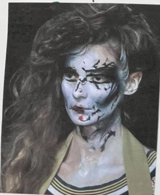
Vivienne Westwood 2014 spring fashion show