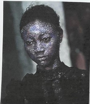
Paris fashion week 2018 - fall/winter

https://www.allure.com/gallery/makeup-artist-val-garland-best-makeup-looks .