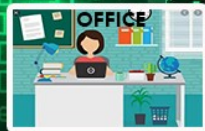
APP SCREEN 8 – SELECT LOCATION TO FIND THE SECRET CODES