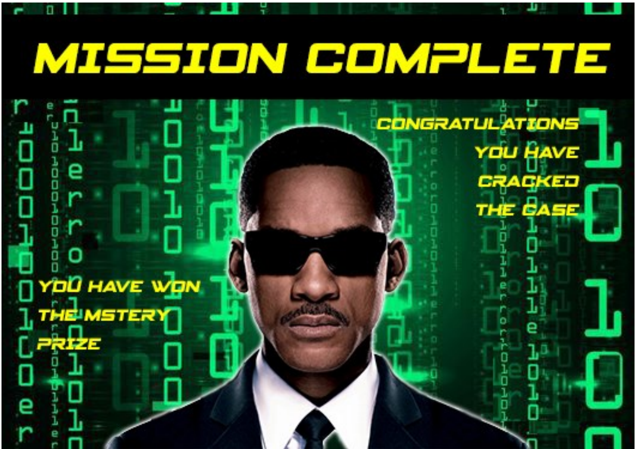
APP SCREEN 12 – FINAL MISSION COMPLETE SHORT VIDEO MESSAGE