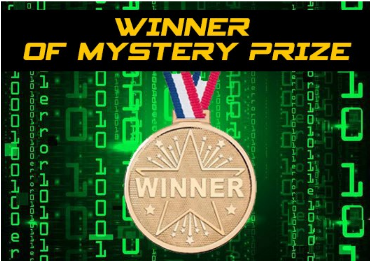
APP SCREEN 13 – FINAL WINNING SCREEN WITH GOLD SPY MEDA