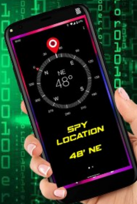
APP SCREEN 9 – ACCESS THE MOBILE COMPASS TO FIND SPY LOCATION

ACCESS YOUR COMPASS & FOLLOW THE DIRECTIONS TO FIND NEXT SECRET CODE